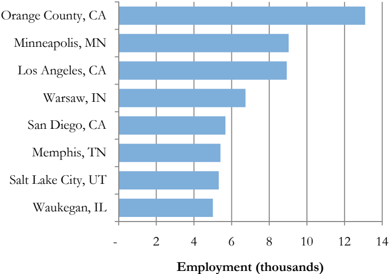
Figure 1: Medical Device Employment in 2009, Largest Counties*

As Figure 1 highlights, Kosciusko County is one of only four counties in the nation with medical device industry employment in excess of 6,000. What sets Kosciusko County apart from these communities (or any other community in the country), is its concentration of medical device employment. The most common measure of regional industry specialization is the location quotient (LQ). In this instance, the LQ is a ratio comparing the medical device industry’s share of total employment in a county to the corresponding share for the nation. Kosciusko County had a medical device employment LQ around 80 in 2009, meaning that this industry’s employment is 80 times more concentrated locally than it is nationally. To put this number in perspective, Owen County, Indiana, had the next highest LQ at 30 followed by Queensbury, New York, and McMinnville, Oregon, with each around 17.